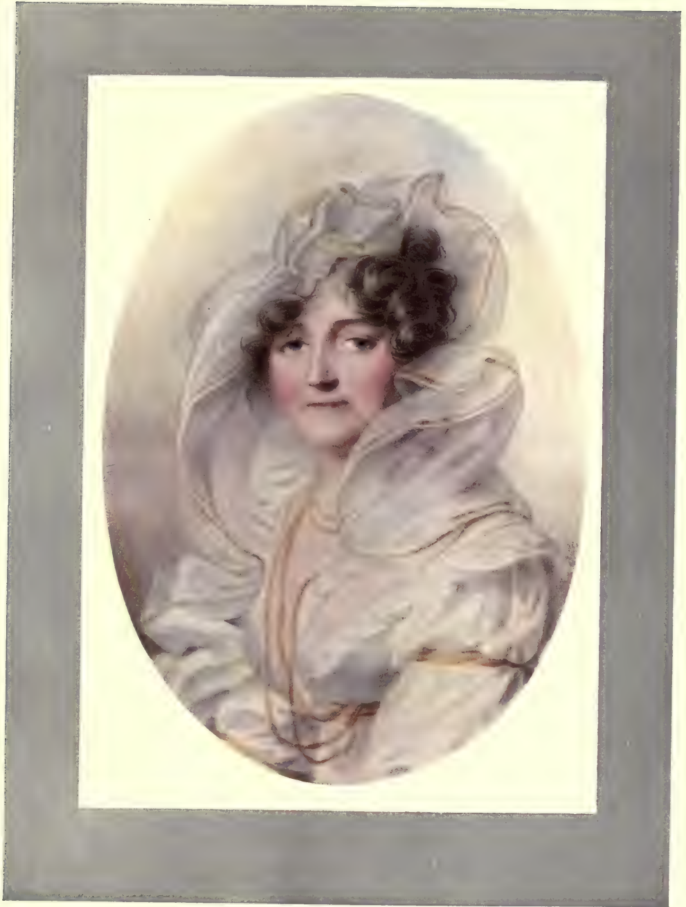
CATHARINE, COUNTESS BEAUCHAMP BY JEAN BAPTISTE ISABEY